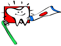
Delta Dental Premiums

Deaconess Abundant Life Communities offers dental insurance to regular Full-Time and Part-Time employees through the Delta Dental Plan. Employees pay 100% of the monthly premium. Coverage begins on your first day of employment.